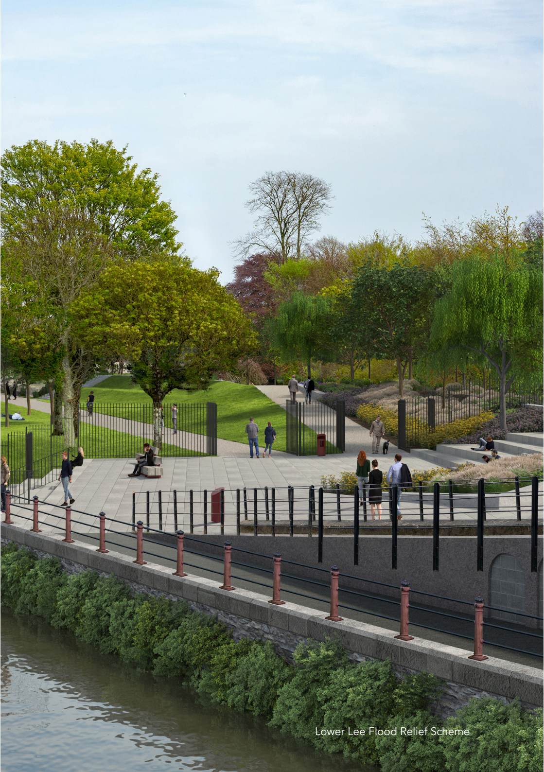
Lower Lee Flood Relief Scheme