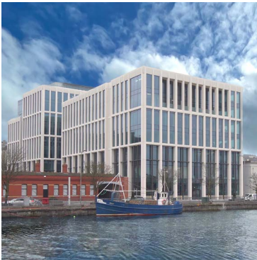
Matheson, Cork office

IRISH MAINPORT HOLDINGS THE MAINPORT GROUP