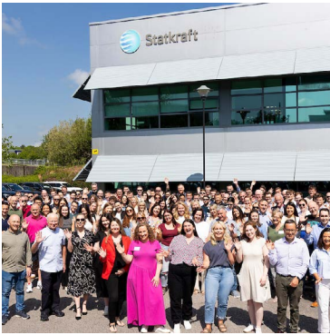
Statkraft Ireland Team