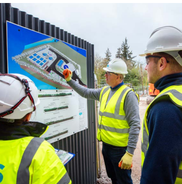
EPS Group - Water, Wastewater, Pumping, Treatment and Renewable Solutions