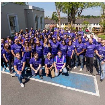
TELUS Days of Giving 2025 at Cork Arc Cancer Support