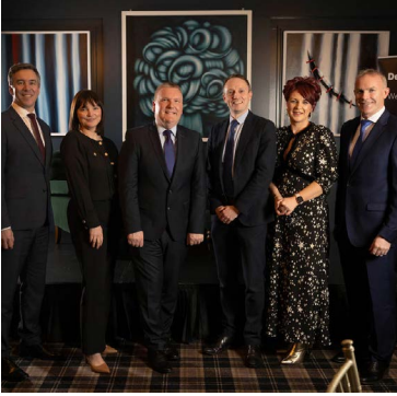
Deloitte Partners with EU Commissioner Michael McGrath at the Non-Executive Directors Dinner