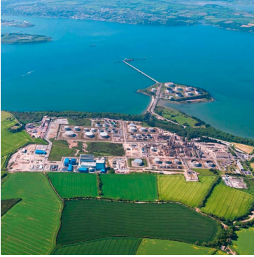
Irving Oil, Whitegate Refinery, Cork