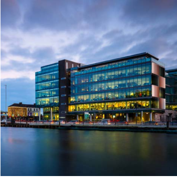
Johnson Controls, Global HQ, One Albert Quay, Cork