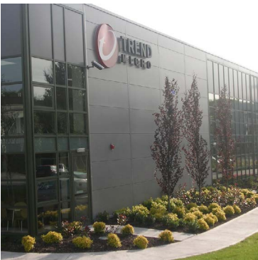
Trend Micro, Model Farm Road, Cork