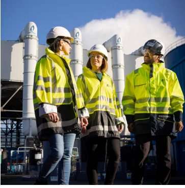
Bord Gáis Energy employees at its 445MW CCGT plant in Whitegate