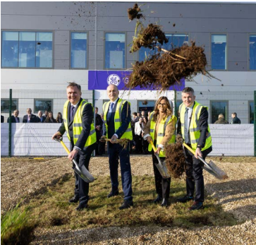
GE Healthcare, Carrigtohill, Cork