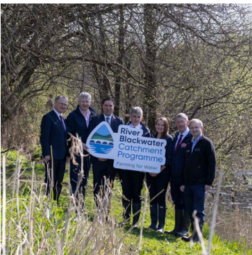
Dairygold launches new collaborative Farming for Water 'River Blackwater Catchment Programme'