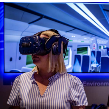
Using immersive technology on projects aids communication, decision- making and engagement