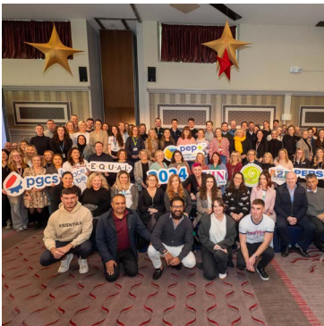
PepsiCo Cork Team