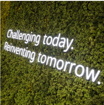
At Jacobs, we make the world smarter, more connected and more sustainable