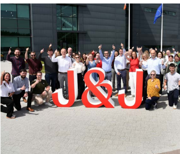
Johnson & Johnson Innovative Medicine, Ringaskiddy Team Members