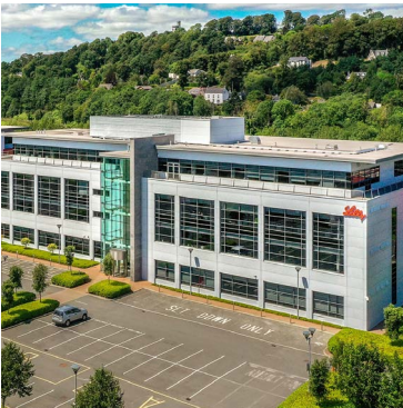
Lilly Global Business Solutions Centre, Little Island, Co. Cork.