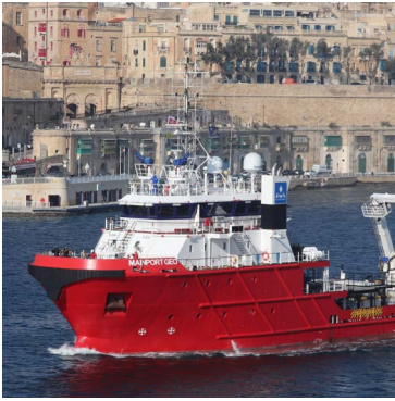
Mainport ship on an offshore wind project