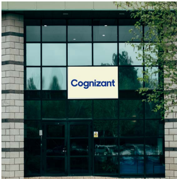
Cognizant, Cork Office