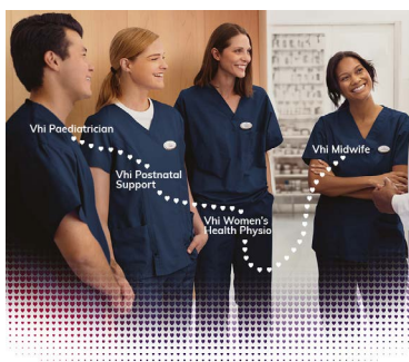
Where healthcare connects - VHI