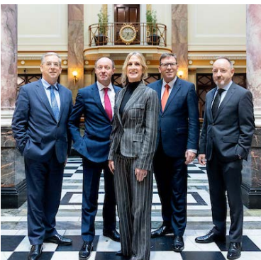
AIB, Cork Senior Team