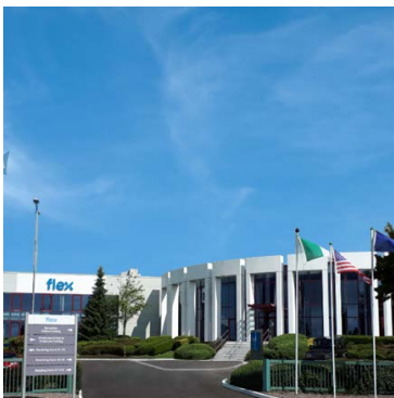
Flex in Cork