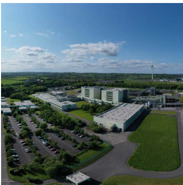
Sterling Ringaskiddy facility