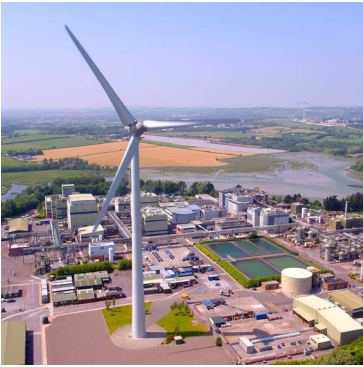
Thermo Fisher Scientific, Cork Site