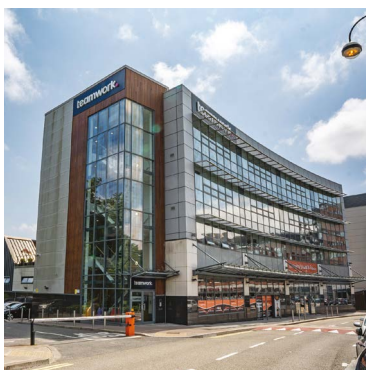
Teamwork.com HQ, Blackpool, Cork