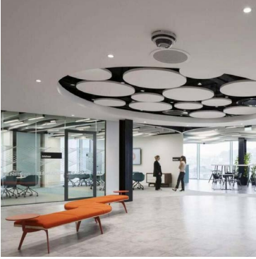
NetApp IHQ Office, Navigation Square, Co. Cork