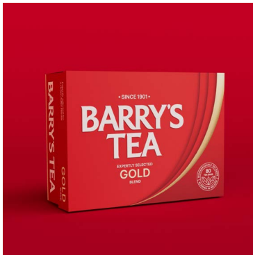
Barry's Tea, Celebrating 125 Years