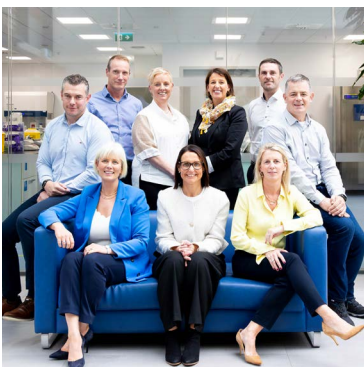
Leadership Team at BioMarin

Founded in 1997, BioMarin is a global biotechnology company dedicated to transforming lives through genetic discovery. The company develops and commercialises targeted therapies that address the root cause of the genetic conditions that it seeks to treat, helping to create a better future for those living with rare genetic disease. In 2024, an investment of €60 million was announced with the expansion of its state-of-the-art facility in Shanbally, Co. Cork, including the addition of a new, four-storey laboratory facility that will enable increased production capacity for currently approved medicines and create room for future growth. This work is ongoing and due to be completed by early 2027. Employing more than 600 people, the expansion adds to BioMarin's footprint in Ireland where the company operates the manufacturing site in Shanbally and a commercial office in Dublin.