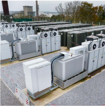
New battery energy storage facilities at Aghada Power Station