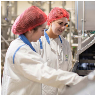
Carbery employees inspect product at our new mozzarella production facility in Ballineen, West Cork