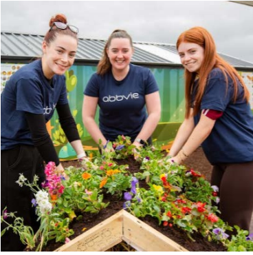
AbbVie Cork employees participating in the company's annual volunteering project.