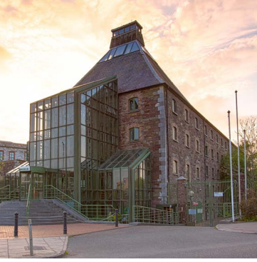
Heineken Ireland, Headquarters, Lady's Well Brewery, Cork