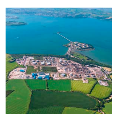
Irving Oil, Whitegate Refinery, Cork