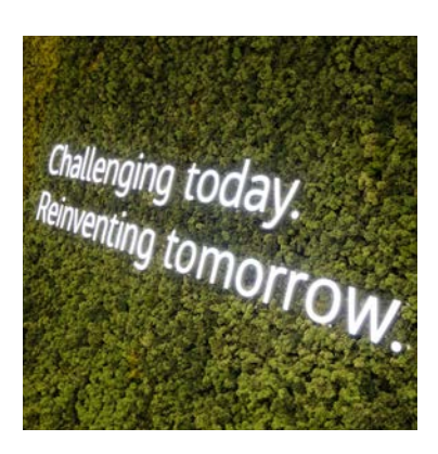
At Jacobs, we make the world smarter, more connected and more sustainable