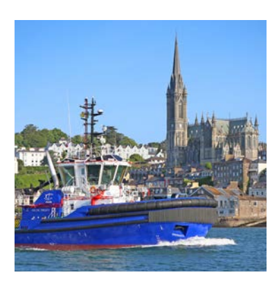
Mainport ship on an offshore wind project