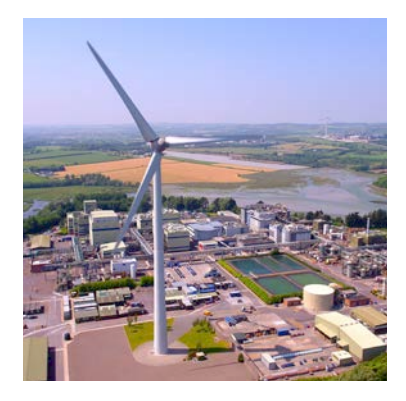
Thermo Fisher Scientific, Cork Site