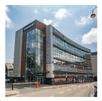
Teamwork.com HQ, Blackpool, Cork