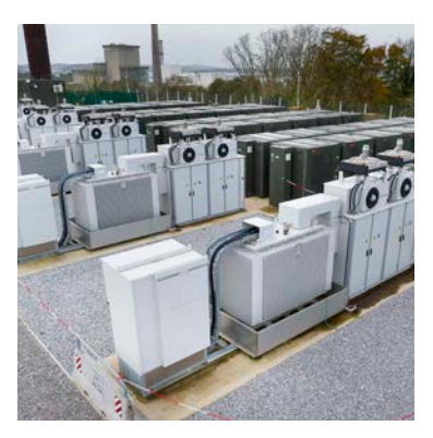
New battery energy storage facilities at Aghada Power Station