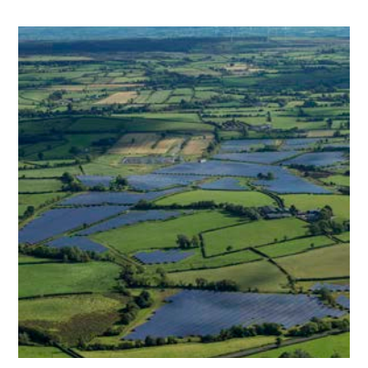
BayWa r.e. Project -Bann Road Solar Farm, Co. Antrim