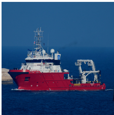
Mainport ship on an offshore wind project