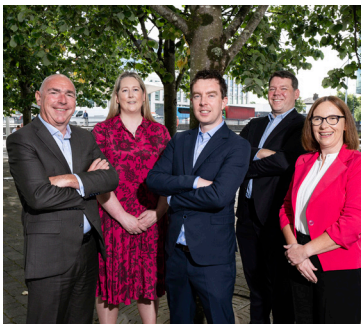
PwC Cork Partners