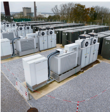
New battery energy storage facilities at Aghada Power Station