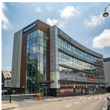
Teamwork.com HQ, Blackpool, Cork