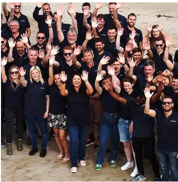
Simply Blue Group Team