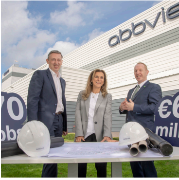
AbbVie Cork team