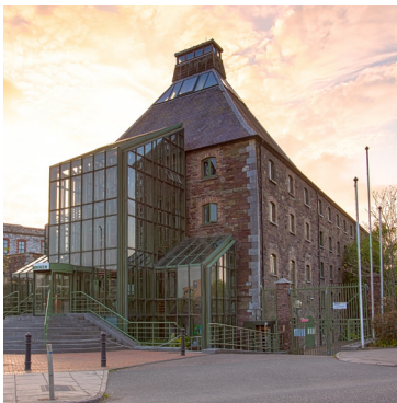
Heineken Ireland, Headquarters, Lady's Well Brewery, Cork