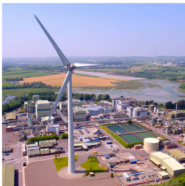
Thermo Fisher Scientific, Cork Site