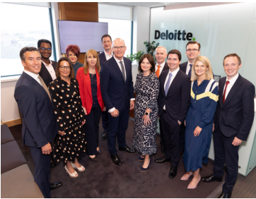
Deloitte partners based in Cork with Simon Coveney Minister for Enterprise Trade and Employment