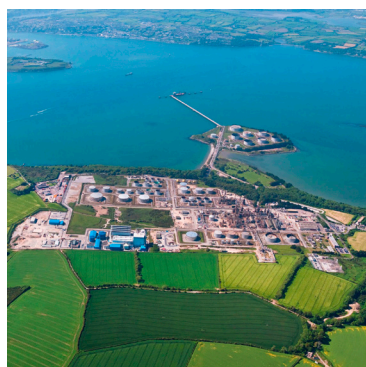
Irving Oil Whitegate Refinery, Cork