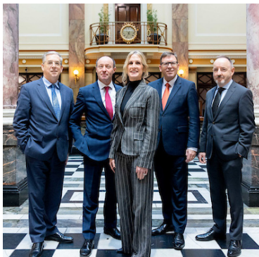
AIB, Cork Senior Team