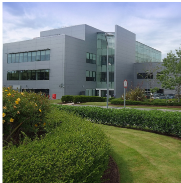
BioMarin, Shanbally, Cork