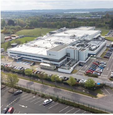
GE Healthcare, Carrigtwohill, Cork