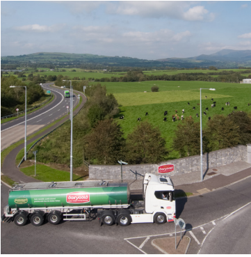
Dairygold's Castlefarm Dairy Processing Complex in Mitchelstown, Co. Cork