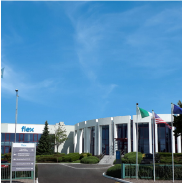
Flex in Cork