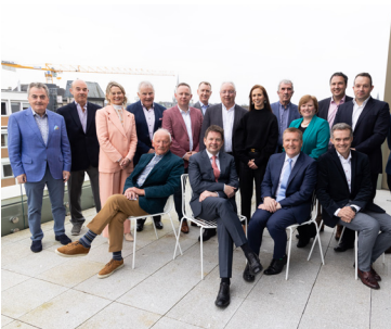
KPMG through the years