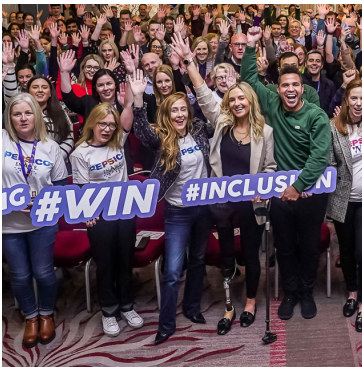
PepsiCo Ireland Team