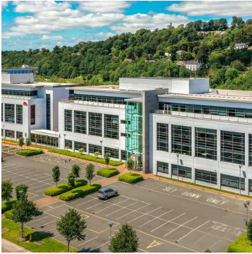
GBS Centre, Little Island, Cork