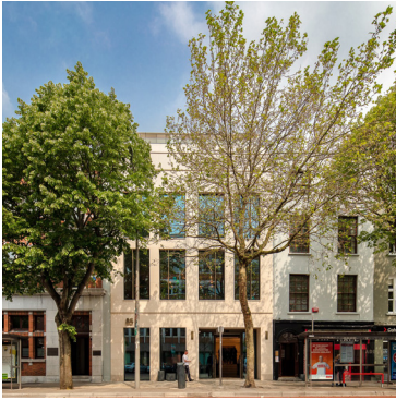
RDJ LLP, 85 South Mall, Cork