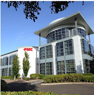
FMC Agro Ireland, Little Island