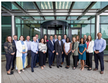
Johnson & Johnson Chairman and CEO Joaquin Duato during a visit to Cork

Challenging today. Reinventing tomorrow.