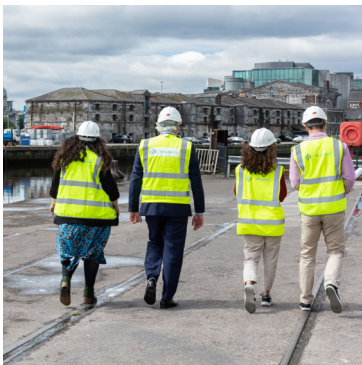
DP Energy Ireland team