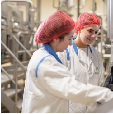
Carbery employees inspect product at our new mozzarella production facility in Ballineen, West Cork