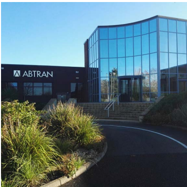
Abtran, Mahon, Cork