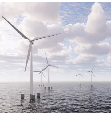
Green Atlantic Floating Offshore Windfarm