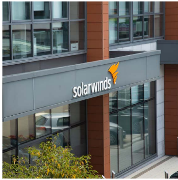
SolarWinds, Mahon, Cork