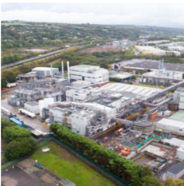
Viatris, Little Island, Cork