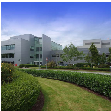
BioMarin, Shanbally, Cork