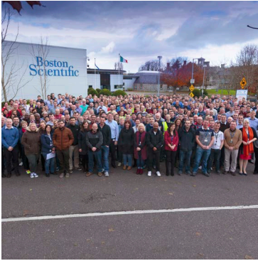
Boston Scientific, Cork Company of the Year 2018