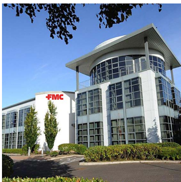
FMC Agro Ireland, Little Island