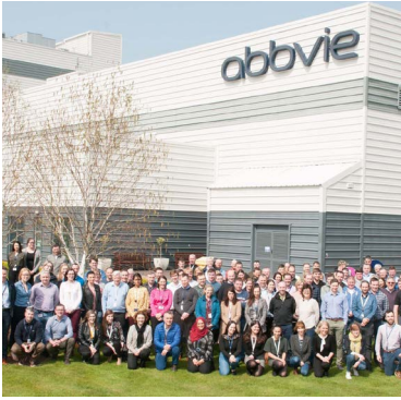
AbbVie Cork team