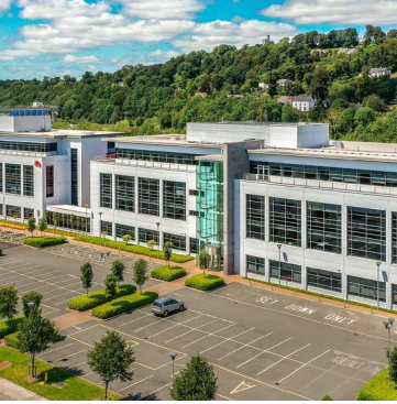
GBS Centre, Little Island, Cork