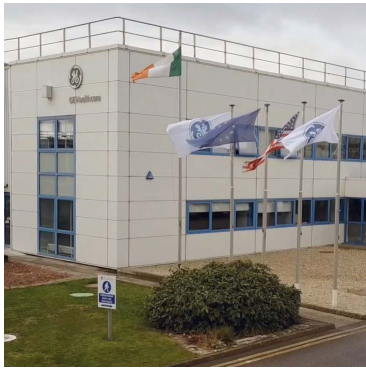
GE Healthcare, Carrigtwohill, Cork