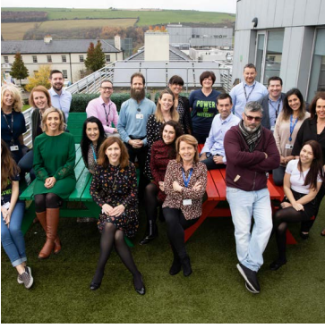
VMware Ireland team members taken in 2019

VMware employs over 1,000 people in Ireland. From virtualization to cloud computing, with a commitment to be a force for good, VMware's reputation for innovation has given rise to a better, more connected world. As leaders in virtualization our transition to remote working through 2020 and 2021 was rapid but we continually focused on the wellbeing of our passionate employees while assisting our customers as they adapted to a new way of working. We believe creativity sparks innovation and inspires employees to think differently and challenge the status quo. Whether it's the products we develop, our approach to sustainability, or how we give back to our community, VMware finds unique ways to bring people together to fuel creative thinking.