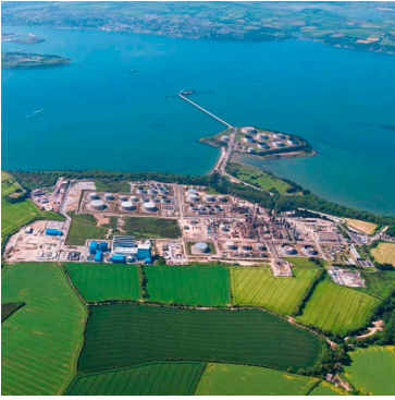
Irving Oil Whitegate Refinery, Cork