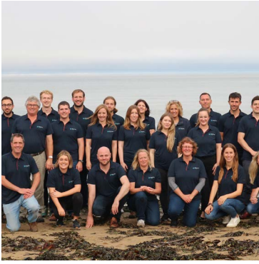
Simply Blue Group Team