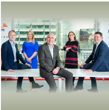
PwC Cork Partners