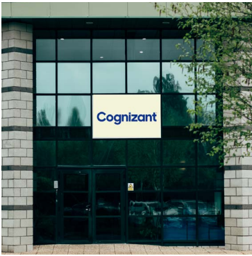
Cognizant, Cork Office