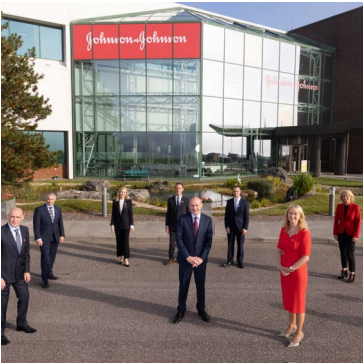
J&J Ireland and Taoiseach Micheál Martin announce new wind energy deal

Challenging today. Reinventing tomorrow.