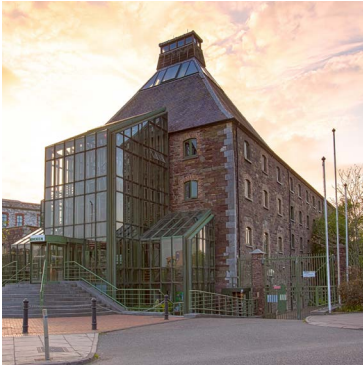
Heineken Ireland, Headquarters, Lady's Well Brewery, Cork